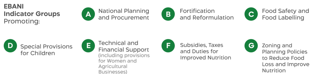
Figure 1: EBANI Indicator Groups

EBANI is a collection of 22 indicators covering seven groups, each aimed at classifying the country-based policies that promote key aspects of an enabled nutrition and business environment (Figure 1, below):